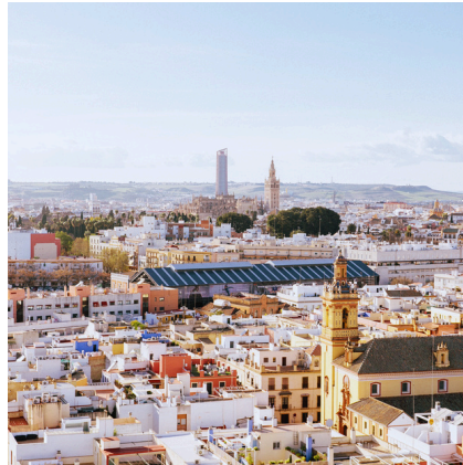
Semesters (Fall & Spring) Summers (Two Terms) Service-Learning option