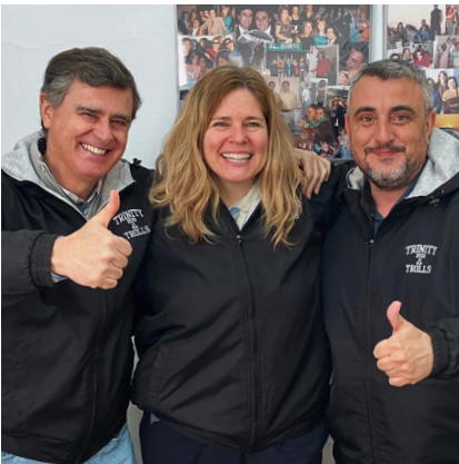
Classes taught by Sevillian professors & homestays with Spanish families