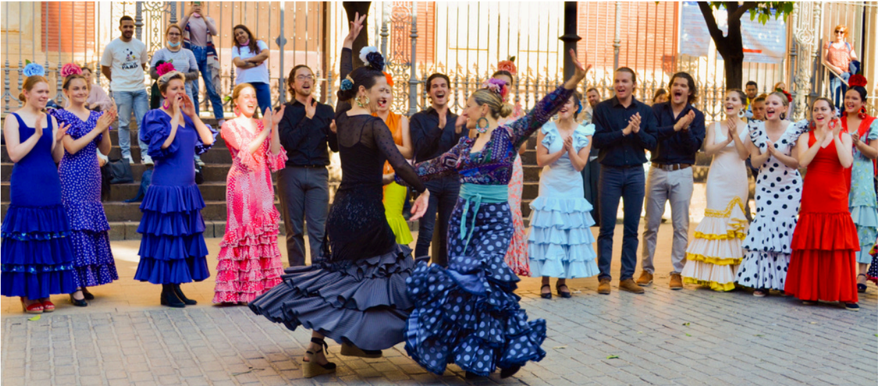
Immersive Spanish language program in Sevilla , Spain