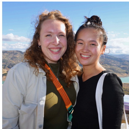
Intercultural Engagement, Immersive Scholarship, & Inclusive Christian Community